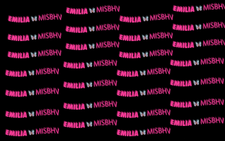
DIGITAL PRINT ON NYLON AND PONTE