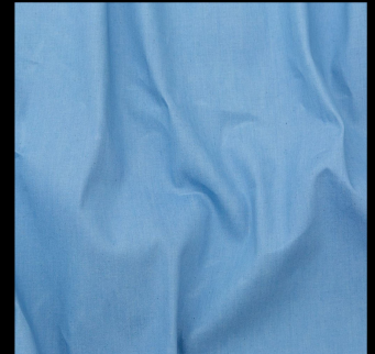
LIGHT WEIGHT DENIM